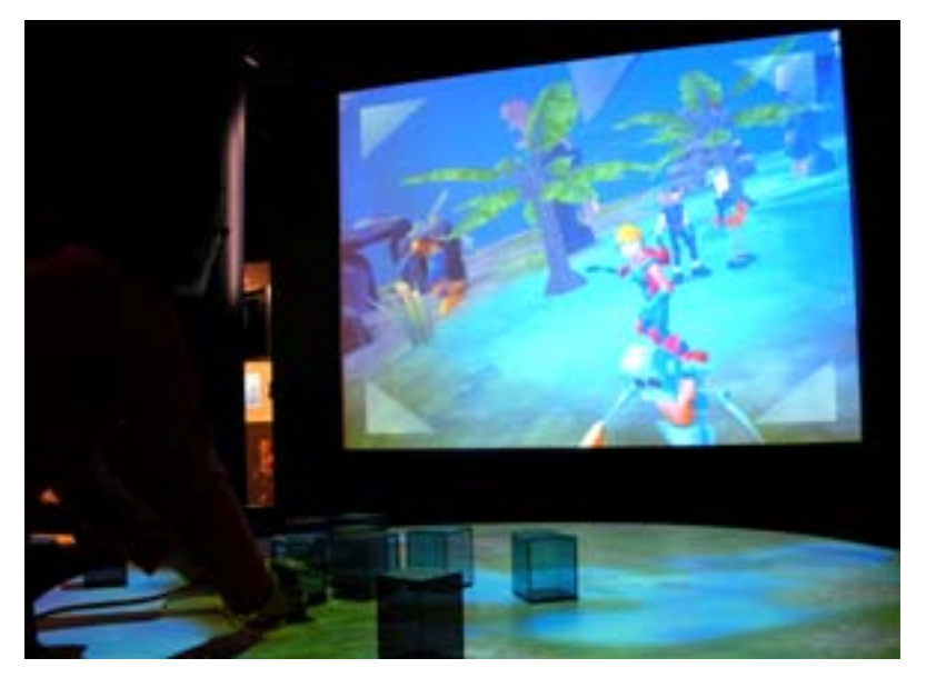
Gulliver's World, Ars Electronica Center