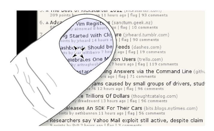
Figure 1: Fingernail displays - artificial fingernails with embedded displays - may help mitigating the fat finger problem or provide always-available, unobtrusive notifications to the user.

University of Regensburg 93040 Regensburg, Germany florian.echtler@ur.de