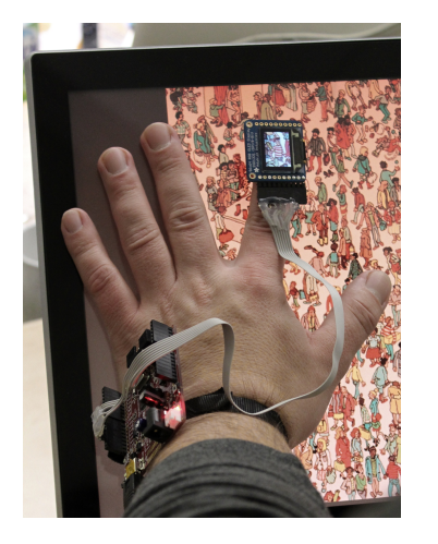
Figure 4: Our first prototype.

computer via a serial-over-USB connection. Images are transferred from host computer to OLED display in an uncompressed RGB565 format at an (unoptimized) update rate of 12 fps. This prototype does not yet have sensors installed and is quite clunky. However, it helps us in thinking about and discussing applications of fingernail displays. We plan to implement three other prototypes that help us answering our research questions: a) sensors-only - a prototype without display but five phototransistors. It allows us to refine and test the fingertip input approach without having to bother with display integration.