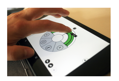
Figure 2: Setting of the preferred value for the square meter parameter on a Nexus tablet. The filled, green semicircle represents the admissible parameter range for floor plan search, while the black line running inside it represents the preferred parameter value.

Different methods such as questionnaires and interviews were used to collect data and review our preliminary assumptions about the design process of the architect and our design. Assumptions included benefits of non-geometry based querying with pies, how the users would interact with the tool and their expectations regarding retrieval tools. 14 architecture students completed the online questionnaire; five experts were invited to semi-structured interviews during