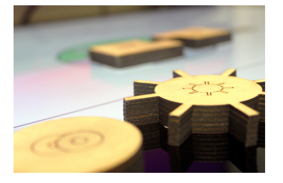
Figure 1: The set of tangibles for the tabletop prototype.

Bauhaus-Universität Weimar Weimar, Germany firstname.lastname @uni-weimar.de