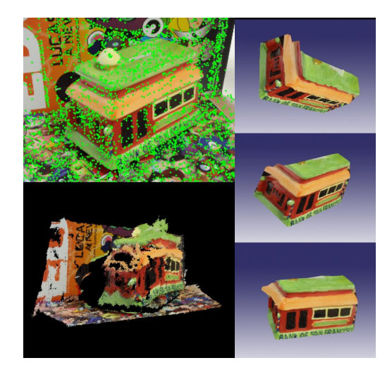
Figure 2: Steps of the reconstruction process. SIFT features are used to match images (upper left), a dense point cloud is reconstructed from matching points (bottom left), finally a textured mesh is produced (right).

simple furniture objects in a room. More concretely, the tasks were to align them with real objects, orient them in a certain direction or inspect them from different perspectives.